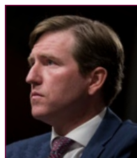
Christopher C. Krebs Founding Partner KS Group